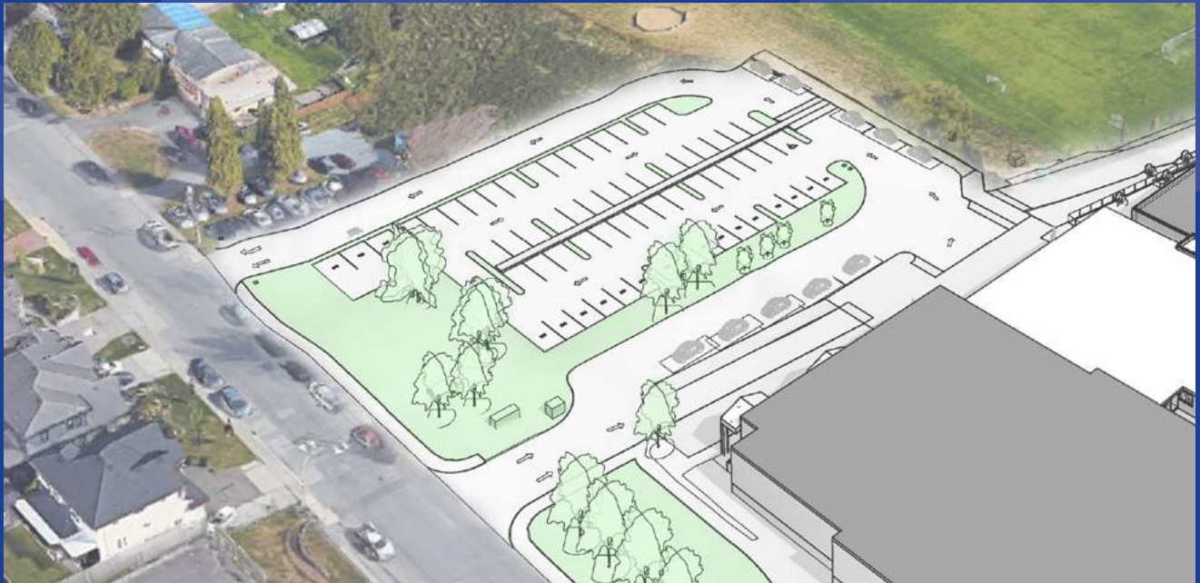
New parking lot with drop off/pick zones, bus loop and separate entrance and exit ways