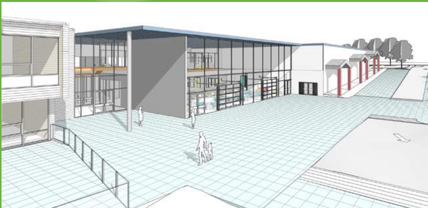
New main entrance to the school and front courtyard