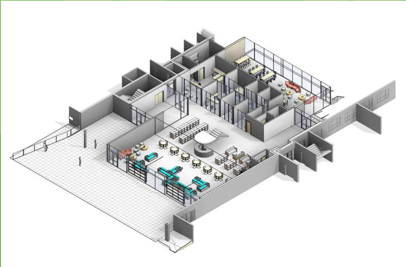
Lower floor showcasing the main entrance to the school, multi-purpose space, administration offices and staff room